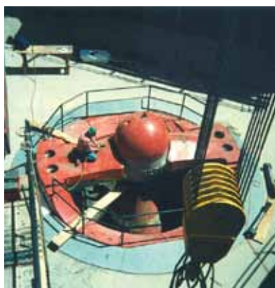
Installation of Primary Gyrator