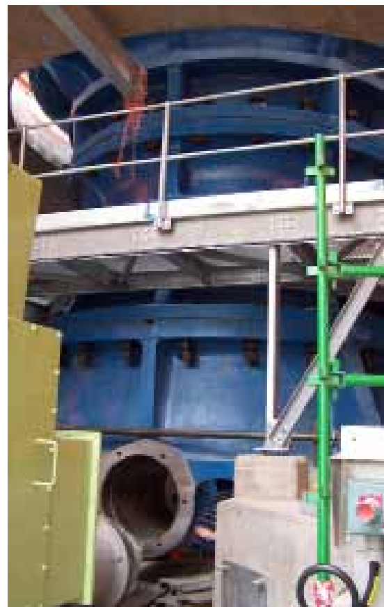
Heavy Duty Cast Steel Sections