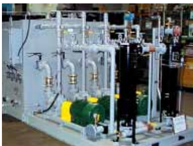
Centralized Crusher Lubrication System