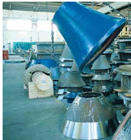
Crusher Manganese Liners