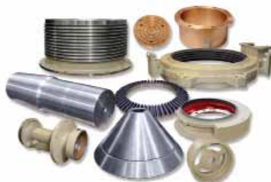
Servicing and Spares