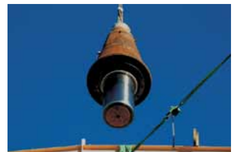
Main Shaft being installed