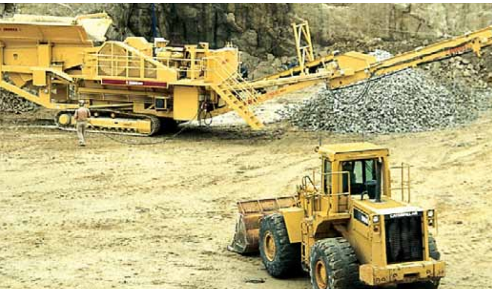
Typical Mobile Jaw Crushing Plant