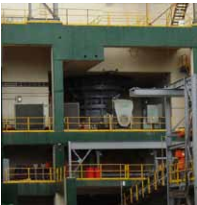
Installation at Bogoso, Ghana